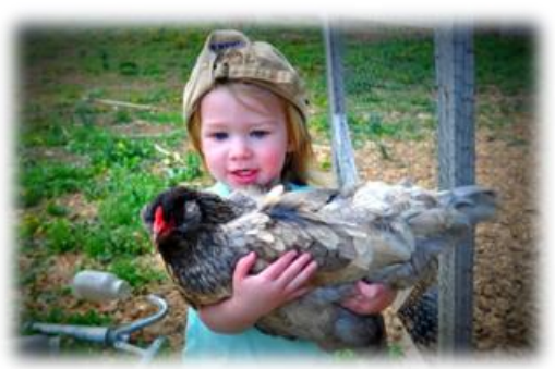
We look forward to seeing everyone on the farm soon! Stay warm and think Spring!