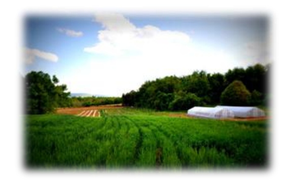
Rye Cover Crop in the Sweet Potato Field